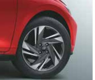
R16 (D=405.6 mm) diamond cut alloy wheels