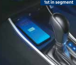
Wireless charger with cooling pad