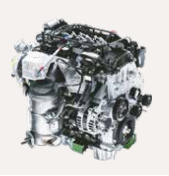
MT & iMT 1st in segment 6MT

73.5 Maximum power kW (100 PS) / 4 000 r/min