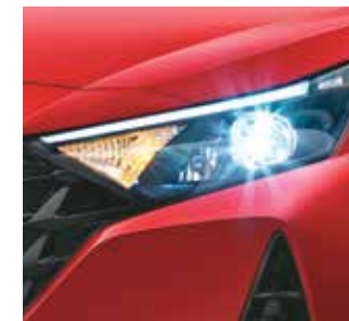
LED projector headlamps