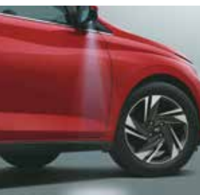
Puddle lamps with welcome function