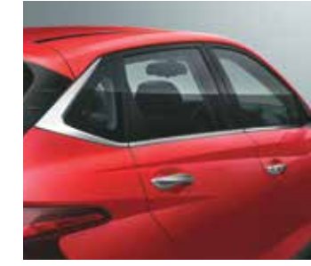
Chrome beltline with flyback rear quarter glass

Other features: Chrome outside door handles | Turn indicators on outside mirrors | Painted black finish side sill garnish with i20 branding LED daytime running lamp (DRL) | Front projector fog lamps | Best in segment