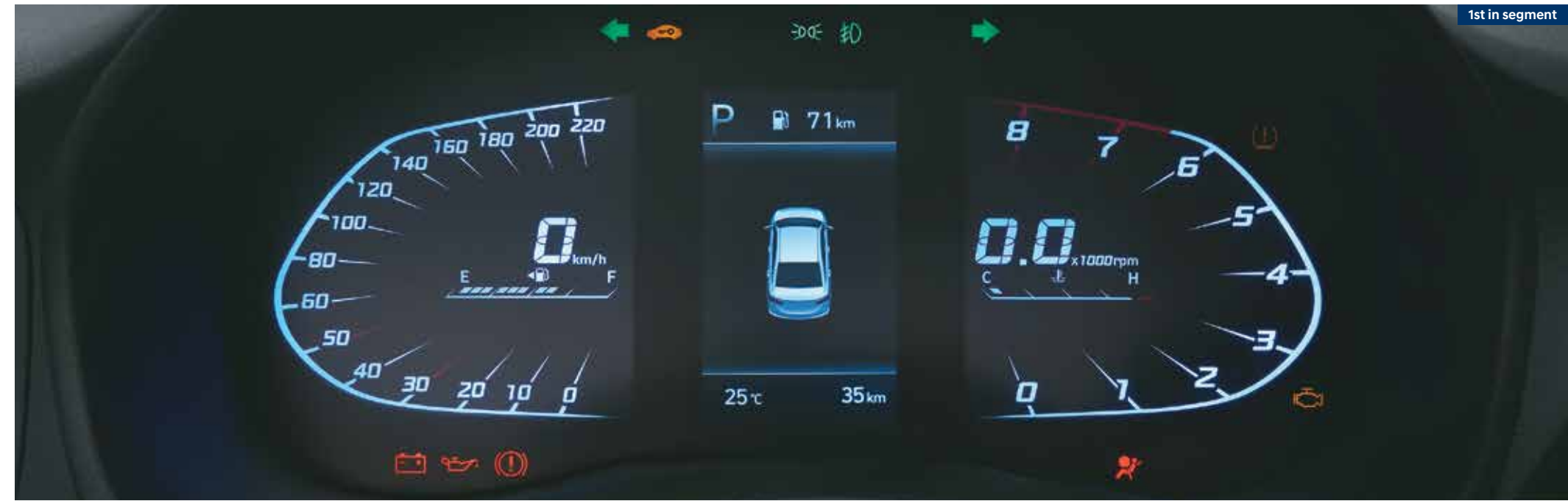
Digital cluster with 10.67 cm (4.2") colour TFT MID

The spirited new VERNA has a ton of features customised to satisfy all your needs. The ingenious new smart trunk to pack all that you love without putting a finger on the boot. Front ventilated seats to keep you cool even in the hot Indian summer. An electric sunroof and a wireless charger to maximise quality time while travelling.