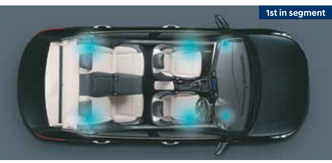
Arkamys premium sound with front tweeters, front & rear speakers

Bluelink features: Hello Bluelink | Remote engine start/stop** | Remote climate control (AC) with engine start** | Cricket scores Push maps by Bluelink connect centre | Tyre pressure information | SOS/emergency assistance | RSA (Road side assistance) Interactive voice recognition | Fuel level information | Dial by number | Indian holidays information | Remote door lock/unlock