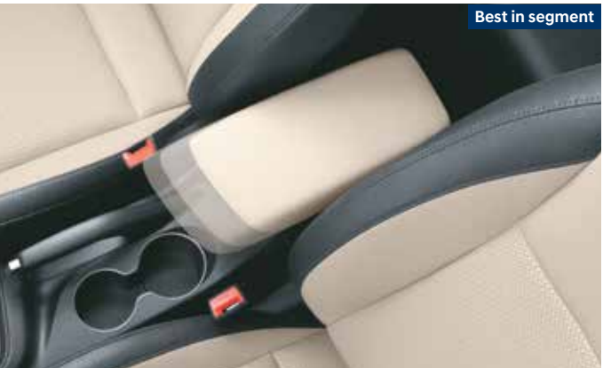
Sliding front centre console armrest with storage

All black interiors with red accents (turbo)