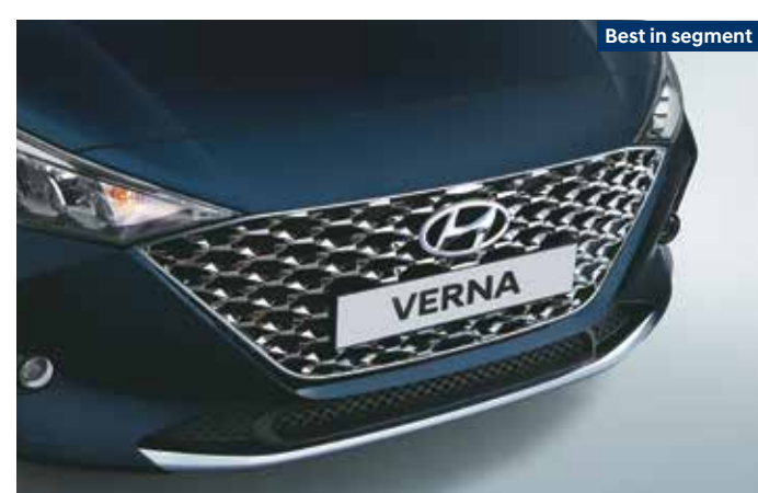
Dark chrome front radiator grille

Take a walk around the spirited new VERNA and be charmed by its exquisitely crafted sensuous sporty design and mesmerising front grille. Observe its new full LED headlamps, LED tail lamps and the twin tip muffler (turbo). Let its sporty R16 diamond cut alloy wheels sweep you off your feet.