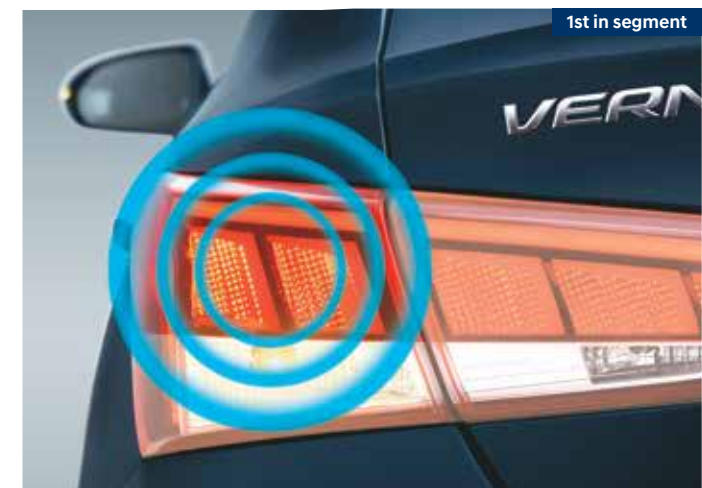
Emergency stop signal (ESS)