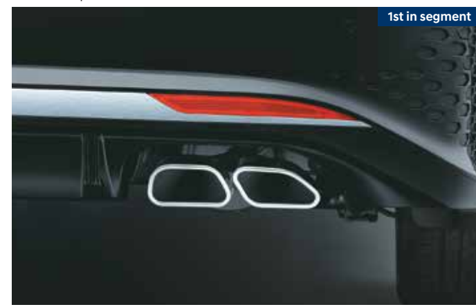
Twin tip muffler (turbo)