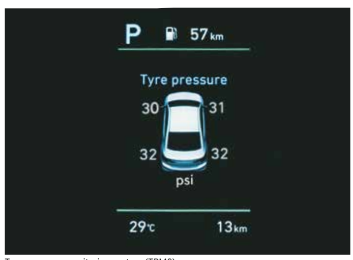
Tyre pressure monitoring system (TPMS)