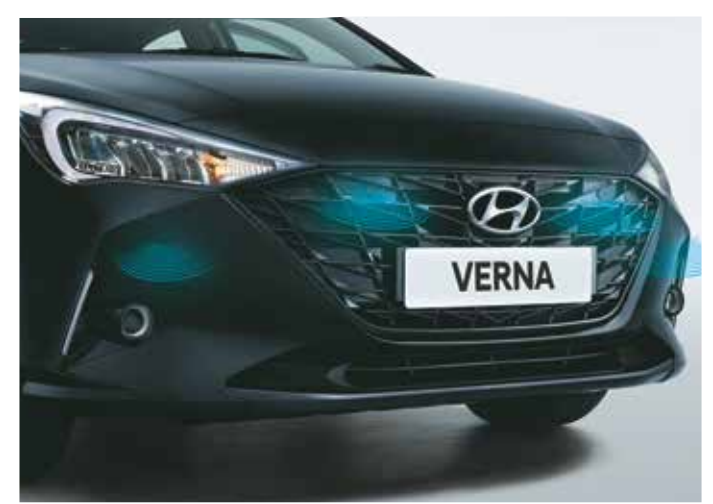
Front parking sensors (turbo)