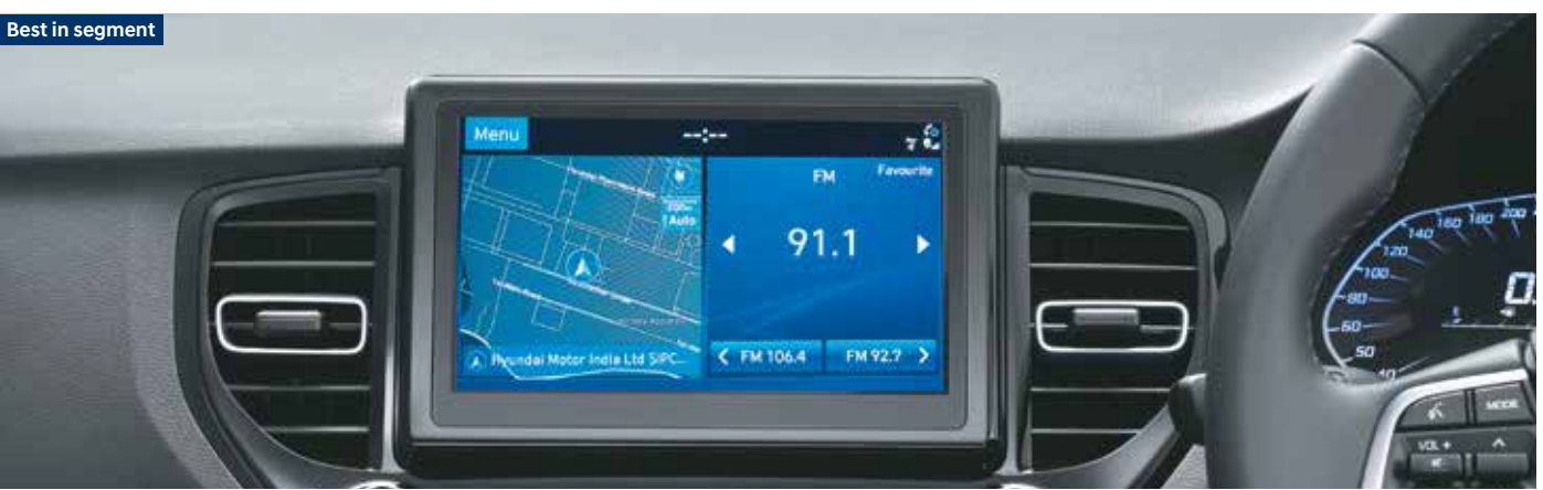
20.32 cm (8") touchscreen AVNT with HD display