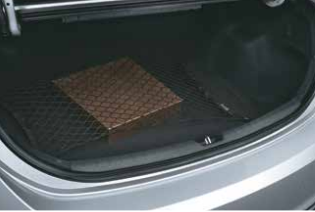
uggage hook & ne