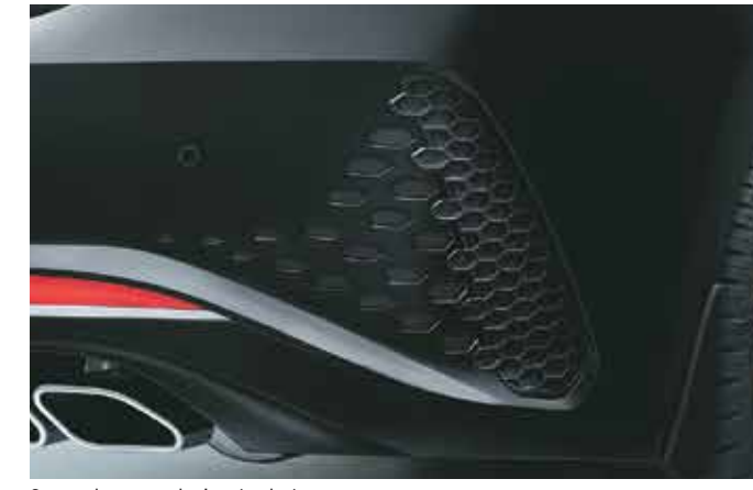
Sporty bumper design (turbo)