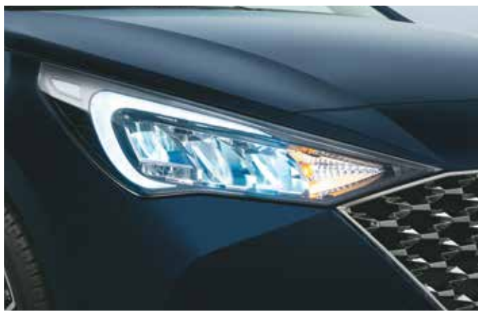
Full LED headlamps