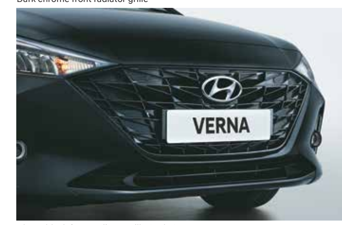
Glossy black front radiator grille (turbo)