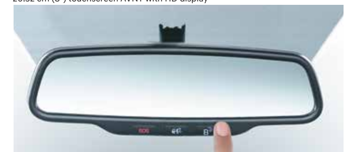
Electro chromic mirror - IRVM with Bluelink switches